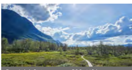
From Luleå: Distance approx 300-440 km and approx 3,5-5,5 hours by car.