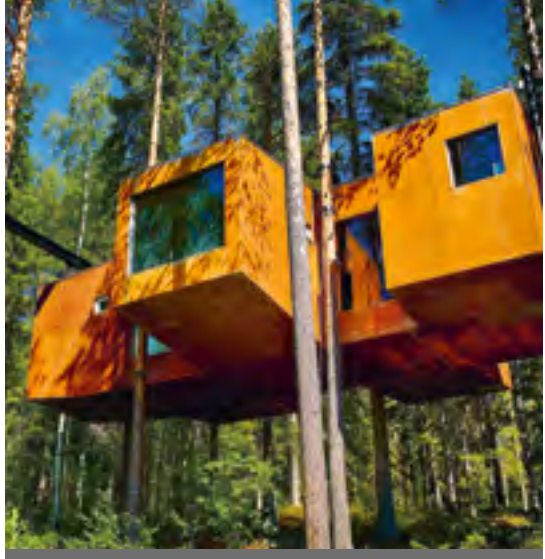
From Luleå: Distance approx 80 km and approx 1 hour by car.