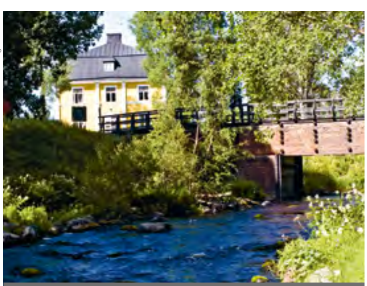
From Luleå: Distance approx 50 km and approx 40 minutes by car.