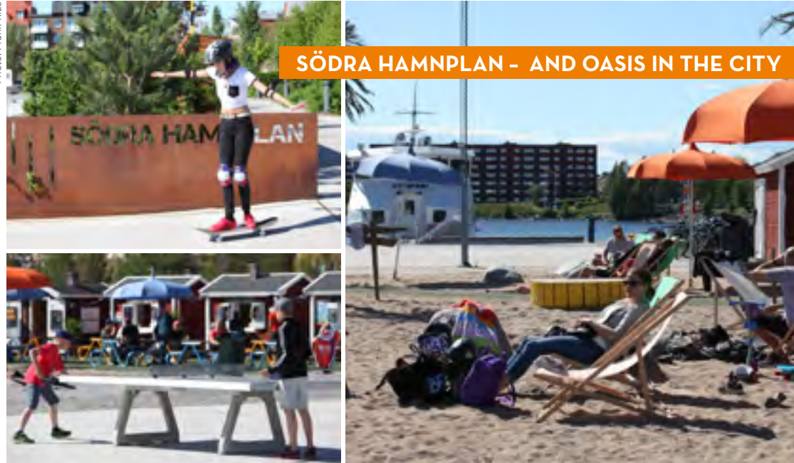
In summer, Södra hamnplan in Luleå is transformed into an oasis inviting both young and old. There is plenty of space for those who want to relax. For those who are more active, thanks to Fritidsbanken, equipment is available to borrow for various activities, free of charge. There are also a number of food trucks, so it's a great place to go and have lunch.