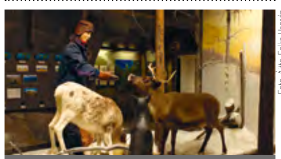
From Luleå: Distance approx 170 km and approx 2 hours by car.