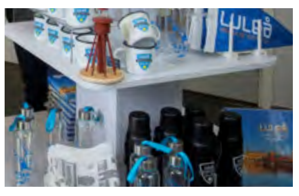
Souvenirs with the local brand Luleå are available for purchase at Luleå Tourist Center and at Visitor Center in Gammelstad.

Start your visit to the world heritage site Gammelstad church town with a visit to the Visitor Center. Here, you will receive a good introduction to the area and all its sights. Kurktorget 1, Gammelstad.