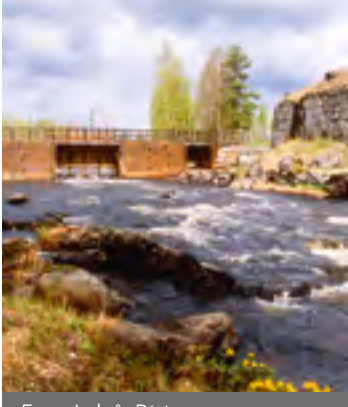
From Luleå: Distance approx

Selets bruk is situated thirty kilometres outside central Luleå, southwest of the Lule River.