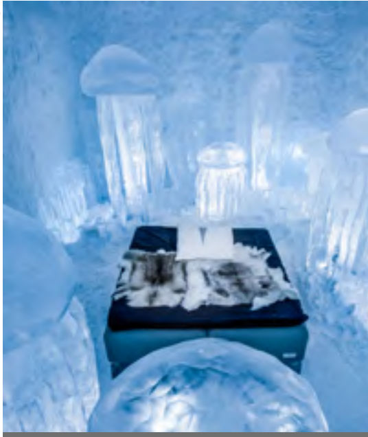
From Luleå: Distance approx 340 km and approx 4 hours by car.